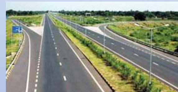
ROAD & HIGHWAY