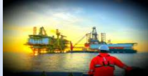
OIL & GAS SECTOR